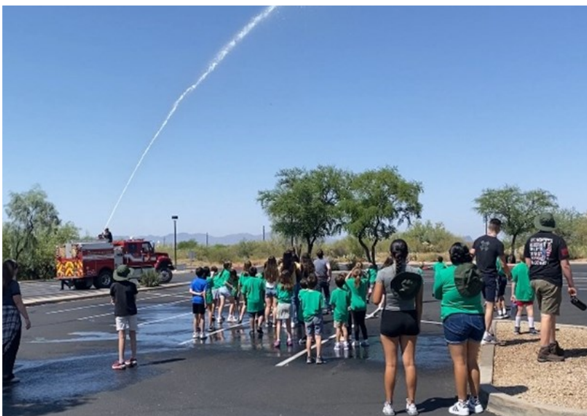
Golder Ranch Fire Department arrived to cool things off on Day 4.