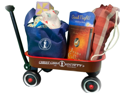
CCST's Wagons are filled with Layettes, Books & Foster Teen Bags