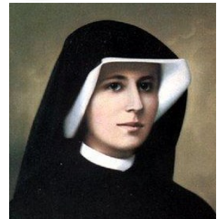
ST. MARIA FAUSTINA KOWALSKA